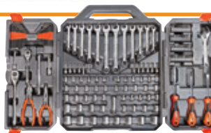
Item no. CTK150

All Torque Product Orders of $1,000 or more in June will receive this 150 Pc Tool Set